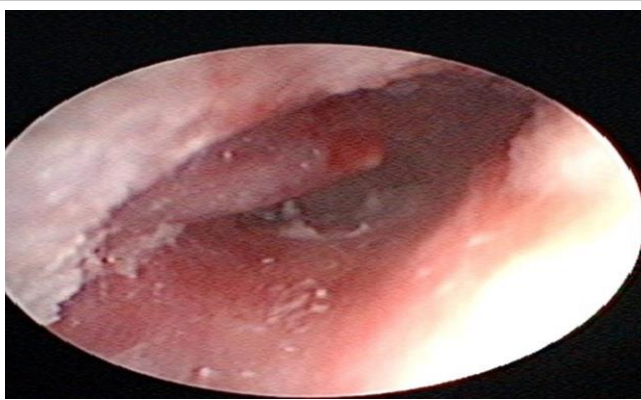
Figure 1 a: Right EAC narrowed with small polyp at EAC (black arrow).

A 25 year-old male with no known medical illness presented with bilateral ear discharge and reduce hearing for 3 months. He denied trauma to the ear, otalgia, vertigo or tinnitus. There was no complaint of prolong cough or any constitutional symptoms. Past medical and family history was unremarkable with no recent travel or tuberculosis contact. Upon initial examination, pus was noted in both of the ear canals. Aural polyp was also seen inside the left ear canal. The tympanic membrane in both ears were not clearly seen as the ear canals were narrowed. A pure tone audiogram has shown profound hearing lost in both ears.