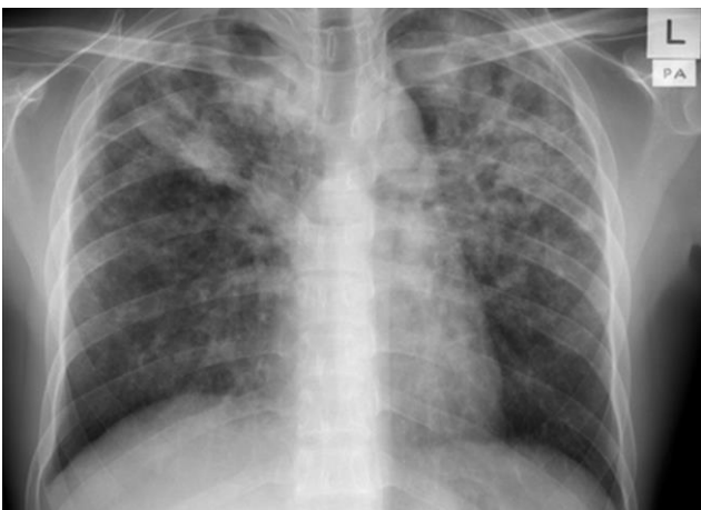
Figure 2c: Anterior and posterior view of chest xray showing bilateral nodular and interstitial opacities more at upper and middle zone consistent with pulmonary tuberculosis changes.