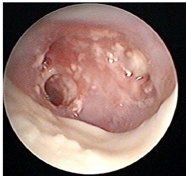
Figure 1 b: Left EAC minimal pus with central tympanic membrane perforation (black arrow).

Patient was initially treated as bilateral suppurative otitis media. He was prescribed a course of oral antibiotics and antibiotic ear drops. Subsequently, during follow up there was no change in the course of disease and High Resolution Computed Tomography (HRCT) of petrous bone was ordered. The HRCT of petrous bone revealed right EAC stenosis with right ossicular erosion, the posterior wall of External Auricular Canal (EAC), tegmen tympani and sigmoid plate dehiscence suggestive of chronic destructive ear disease (Figure 1).