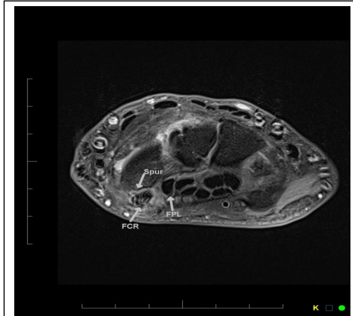
Figure 2: MRI image (Proton Dense with fat saturation) of wrist, at the level of scaphoid spur before diving deep to 2 nd metacarpal insertion, FCR is grossly thickened with multiple interstitial high signals (“marbelling effect”) and peritendon oedema, suggesting tendinitis with intra substance tears.(compare with normal black FPL, flexor pollicis longus tendon).