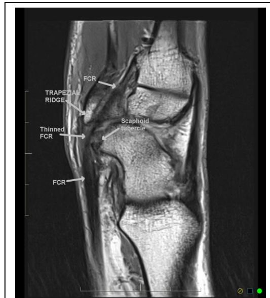
Figure 4: MRI (Proton Dense Sagittal) scaphoid spur with tendinopathy and tear of FCR in the segment arching over the scaphoid tubercle (Spur) diving under an irregular trapezial ridge, prior to insertion at the 2 nd metacarpal base.