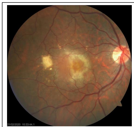
Figure 2a: Fundus photography of resistant n-AMD.

angiography or OCT despite 4 or 8 weekly regular aflibercept injections after one year treatment period. The resistance may occur in every treatment regimes with different anti-VEGF agents. Therefore distinguish between resistance to anti-VEGF therapy” and “resistance to anti-VEGF agents” is essential because some eyes seem to be resistant may respond to different anti-VEGF agents (Figure 2a, Figure 2b).