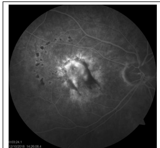
Figure 1b: Fibrous scar due to n-AMD evaluated by fluorescence angiography (FFA).

Cross-sectional follow-up studies showed the prominent enlargement of CNM associated atrophy and fibrosis within the region previously occupied by the neovascular lesions under treatment. According to the multivariate regression analysis, atrophy and fibrotic scar can occur in 2 to 7 years during the anti-VEGF treatment. The chorioretinal atrophy was found in 98% of subjects who had anti-VEGF treatment 7 or 8 years previously [6,13-16]. Zarubina et al [10]. observed macular atrophy (MA) in only 16% of eyes with treatment-naïve n-AMD. However, 51% of eyes of their patient had not MA initially developed neovascular-associated MA and fibrotic