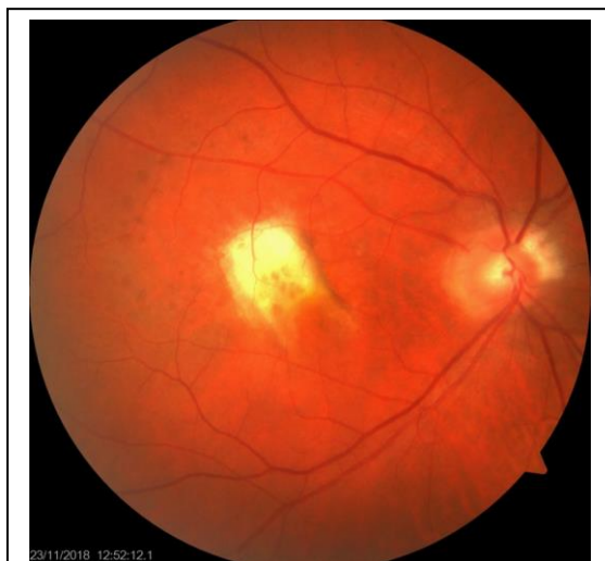
Figure 1a: Fundus photograph of Fibrous scar due to neovascular Age-related macular degeneration (n-AMD).

hemorrhage, retinal atrophy, or fibrosis can occur even under the regular Anti-VEGF treatment [8-12] (Figure 1a, Figure 1b).