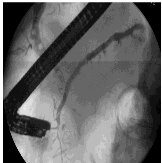
Figure 3: Severe chronic pancreatic with CBD stricture and biliary stones.