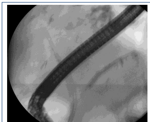
Figure 4: Multiple biliary plastic stenting for chronic pancreatitis related stricture.