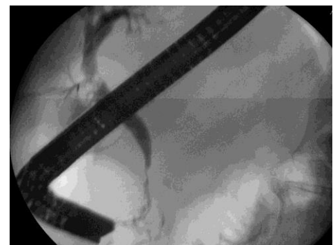
Figure 2: Related chronic pancreatitis CBD stricture.

option of temporary placement in patients with CP and associated common duct stricture who failed prior plastic stent therapy [92-96]. PCSEMS left in place over time decrease in patency, requiring additional endoscopic interventions [92,93]. Long-term results were similar between simultaneous plastic stents and FCSEMSs in terms of clinical success, strictures resolution, stricture recurrence and stents migration [93].